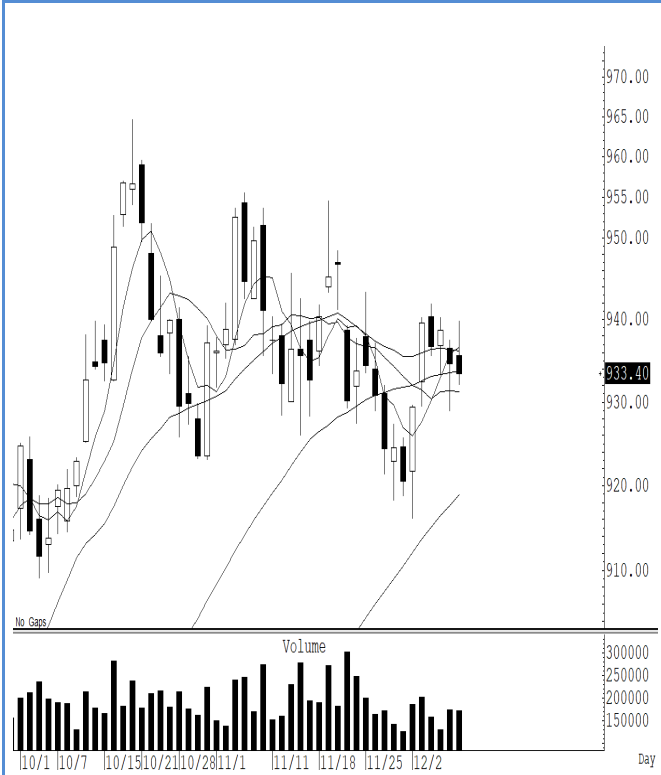
S50Z24 (Close 933.40 Chg -1.20)